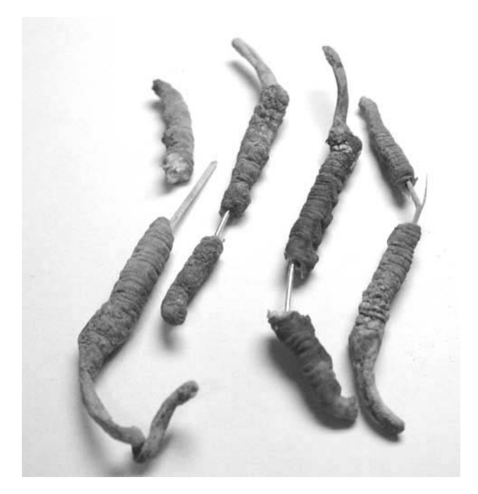
Fig. 1 Wire and twigs inserted into Cordyceps to increase weight.

Another issue has been raised regarding the quality of Cordyceps: lead contamination. Incidents of lead poisoning from consumption of Cordyceps by people in China and Taiwan have been reported.<sup>[5]</sup> A practice of adulteration, long practiced by the collectors of natural Cordyceps, introduces excessive lead into the organism. As found in its natural state, Cordyceps is attached to the mummified body of the caterpillar, from which it arises. It is harvested whole in this form, dried, and supplied into the market. Because Cordyceps is sold by weight, the collectors have historically inserted a small bit of twig into many of the caterpillars, resulting in an increase in weight.<sup>[2]</sup> Better quality